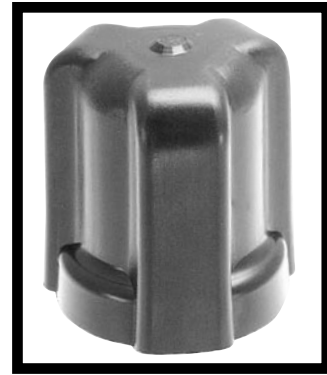
Switch Boot P/N 79380 for Vacuum and Pressure

Type: Direct action blade contact Contacts: Silver alloy, gold plated Set Point: Factory set from 0.5 to 150 PSI Operating Pressure: 150 PSI for 0.5-24 PSI set point range, 250 PSI for 25-150 PSI set point range Proof Pressure: 500 PSI Burst Pressure: 750 PSI for 0.5-24 PSI set point range, 1250 PSI for 25-150 PSI set point range.