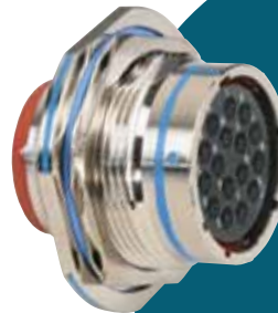
MS3474 jam nut receptacle