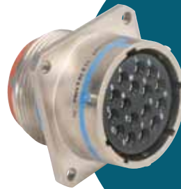
MS3470 wall mounting receptacle with narrow flange