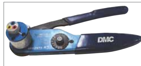
Example M22520 Series Crimping Tool for size 20, 16 or 12 contacts, and has a positioner that can be dialed for each contact size.

** Min. diameters to ensure moisture proof assembly; max. diameters to permit use of metal removal tools.