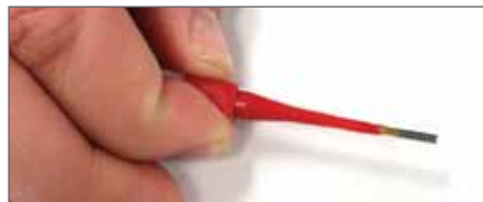
Plastic tool with contact in proper position.