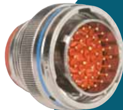
MS3476 straight plug MS3475 plug with RFI grounding fingers