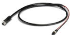
GOF MM cable, assembled with M12 OPTIC to LC duplex

Assembled FO cable, round cable, 50/125 µm GOF-MM fiber, M12 to LC duplex, for installation inside housing