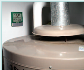
Monitoring Dew Point levels in a Basement for potential mold growth.