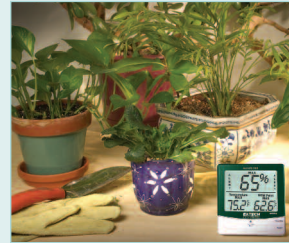
Checks the Humidity and Temperature levels for optimal plant growth in greenhouses.