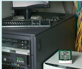
Alerts low Humidity levels in Computer rooms to help prevent electrostatic conditions.