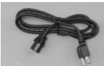
Three Conductor Electrical Equipment Cords Use with Computer Monitors, Printers, Peripheral Devices & other Electronic Equipment, 7 Amp 125 V, 18 AWG.