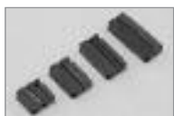
Dual Row Socket Connectors - Headers (0.01" x 1" Spacing w/Strain Relief)