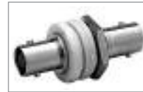
Isolated Dual BNC (F) 1/2" & 5/8" Chassis Mount Hole