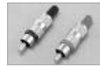
RCA Plug (M) Metal