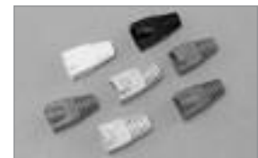
Colored Snagless Boots for RJ-45 8 Conductor Shielded and Unshielded Modular Plugs.