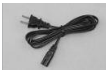
Panasonic Replacement AC Power Cords, 6 ft.