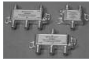
CATV Digital Ready Splitters Horizontal, 5 MHz to 1 GHz

Features solder sealed back plate providing 130db RF shielding, a printed circuit design that ensures performance up to 1 GHz, and a specially plated Zinc housing and 360° port sealing sleeves allow for excellent corrosion resistance. Port spacing allows for easy installation of security shields, and each comes complete with a grounding screw.