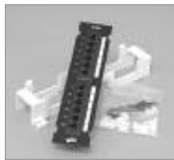
Vertical Wall Mount w/Bracket RJ-45/110 IDC, EIA 568A/B