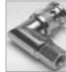
Right Angle, Twist-On BNC (M) 1 Piece, Solderless