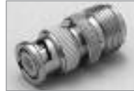
UG-255 Adapter UHF (F) to BNC (M)