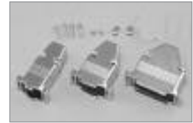
Shielded Metal 'HM' Series D-Sub Hoods includes Hardware, Silver.