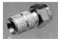
Twist-On F-59TW (M) with 1/2" Grip for Standard RG-59.