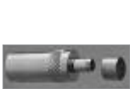
Push-On F-59PG (M) or RG-59 Cable with Center Pin.