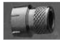
Twist-On F-59TW (M) for RG-59 with Male Quick Disconnect.