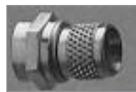
Twist-On F-59TW (M) for Standard RG-59 Cable.