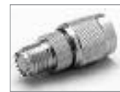
TNC (M) to Mini-UHF (F)