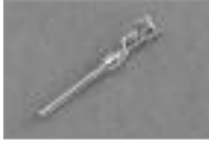
Standard D-Sub Pins for 98 & 99 Series (M) Gold Plated