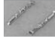
High Density D-Sub Pins for 98 & 99 Series (F) Gold Plated