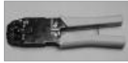
Deluxe Modular Crimping Tool that cuts, strips and terminates 2, 4, 6, 8, and 8 Keyed, 10, DEC 4 & 6 and 4 Conductor Handset Plugs. (Works on AMP™ RJ-45 Plugs only.)

Non-Ratchet No. 24-4681P w/ Ratchet No. 24-4682P