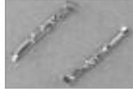
Standard D-Sub Pins for 98 & 99 Series (F) Gold Plated