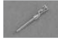
High Density D-Sub Pins for 98 & 99 Series (M) Gold Plated