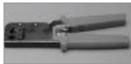
Modular Crimping Tool that cuts, strips and terminates 2, 4, 6, 8, & 8 Keyed Modular Plugs. (Will not work on AMP™ RJ-45 Plugs.)

Non-Ratchet No. 24-4680P w/ Ratchet No. 24-4680RP