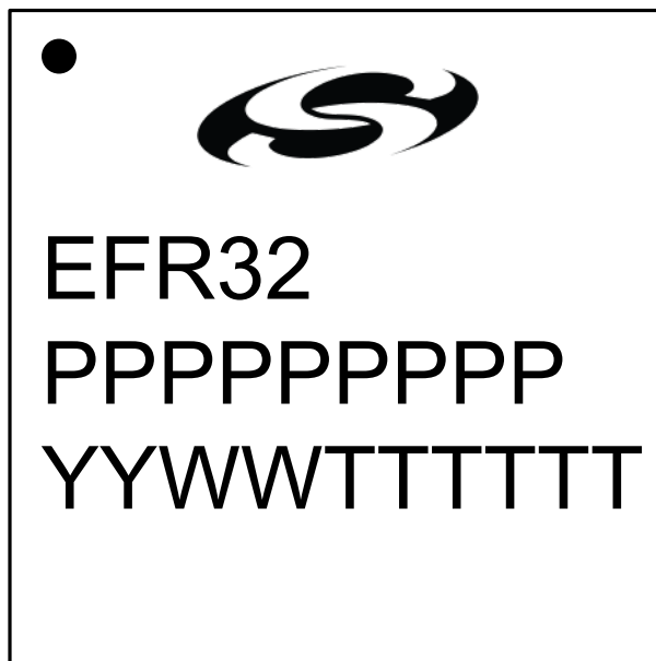
Figure 8.3. QFN32 Package Marking