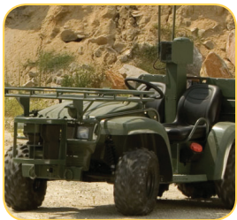
Navigation and Control