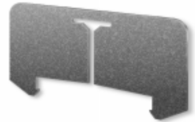
Fuse End Plate