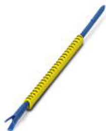
Conductor marking collar, Labeled with the number: 6, white, Width: 3.2 mm

Please be informed that the data shown in this PDF Document is generated from our Online Catalog. Please find the complete data in the user's documentation. Our General Terms of Use for Downloads are valid ( http://phoenixcontact.com/download )