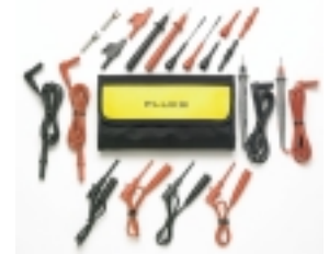
Leads, Probes and Clips Compatibility Chart