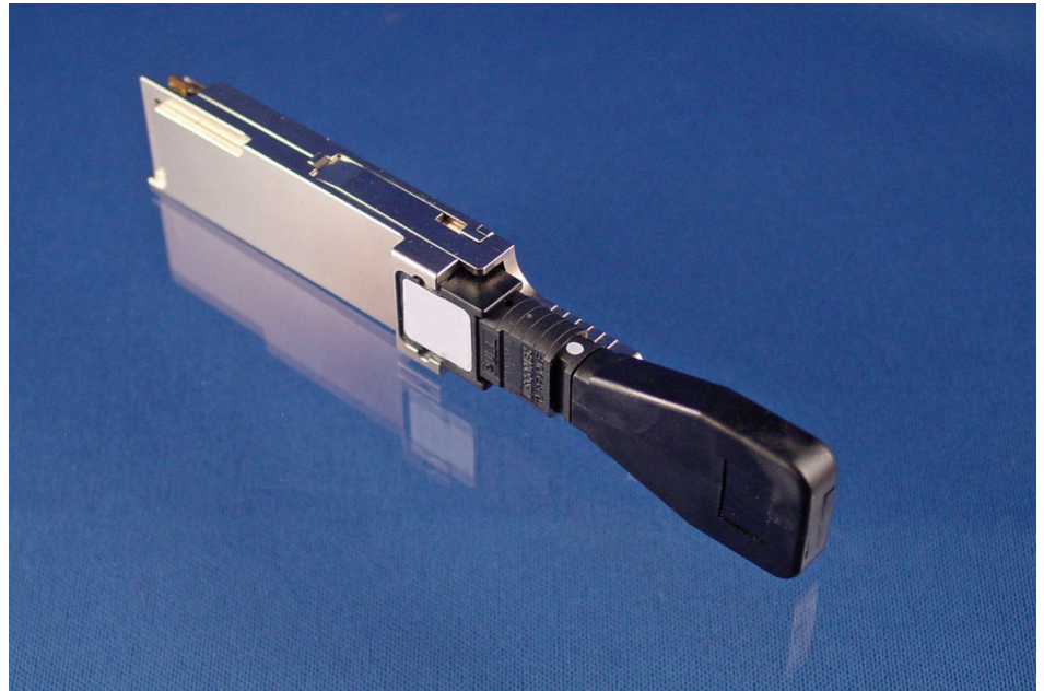
MPO Loopback with QSFP transceiver