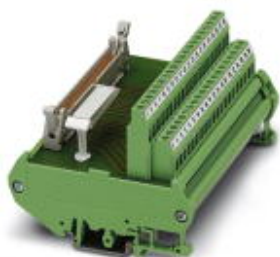
VARIOFACE interface module, for MODICON® TSX Quantum, with MODICON®-specific labeling, for I/O of 32 channels

Please be informed that the data shown in this PDF Document is generated from our Online Catalog. Please find the complete data in the user's documentation. Our General Terms of Use for Downloads are valid ( http://phoenixcontact.com/download )