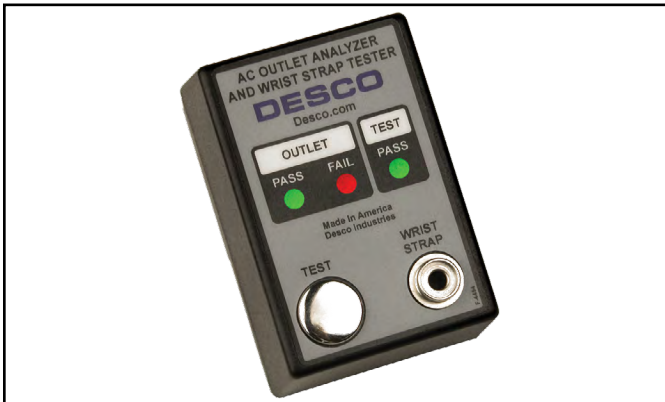
Figure 2. Desco 98131 AC Outlet Analyzer and Wrist Strap Tester