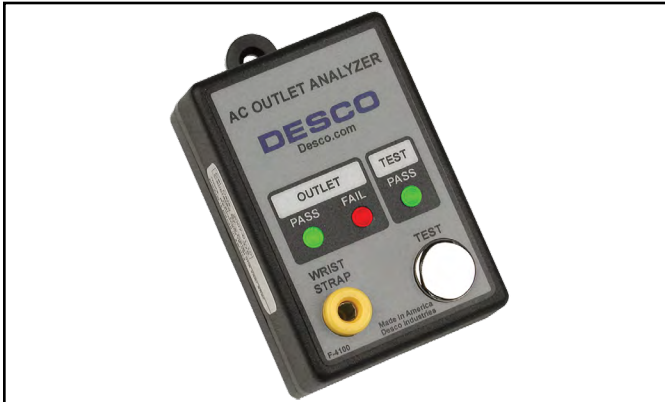
Figure 1. Desco 98132 AC Outlet Analyzer and Wrist Strap Tester