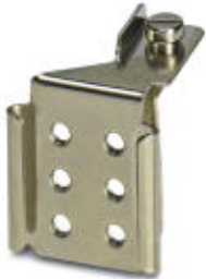
Screw holder, for storing a maximum of 6 switch screws of the ISSB 10-8

Please be informed that the data shown in this PDF Document is generated from our Online Catalog. Please find the complete data in the user's documentation. Our General Terms of Use for Downloads are valid ( http://phoenixcontact.com/download )