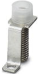
Step bracket, Number of positions: 2, Color: silver

Please be informed that the data shown in this PDF Document is generated from our Online Catalog. Please find the complete data in the user's documentation. Our General Terms of Use for Downloads are valid ( http://phoenixcontact.com/download )