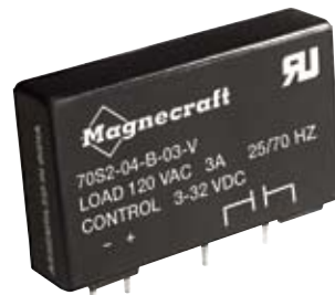
70S2 V (3 Amp)