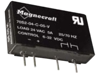
70S2 V (5 Amp)

Since acquiring this line of miniature SSRs from Grayhill, this product has continuously evolved both functionally and visually. The 70S2 Series relays are designed for medium-power loads. The design incorporates a triac output for AC loads and MOSFETs for DC loads. The 70S2 Series relays use optical isolation to protect the control from transients. The 70S2 compact package is available in a combination of screw, fast-on or PCB terminals. Its compact size makes it ideal for designs where space is limited. The 70S2 Series relays have excellent thermal performance.