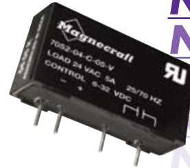
70S2 V (5 Amp)