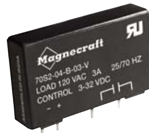
70S2 V (3 Amp)