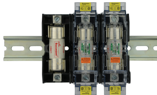
Fuses not included.