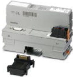
Axioline F bus coupler for PROFIBUS DP (including bus base module and connector)

Please be informed that the data shown in this PDF Document is generated from our Online Catalog. Please find the complete data in the user's documentation. Our General Terms of Use for Downloads are valid ( http://phoenixcontact.com/download )