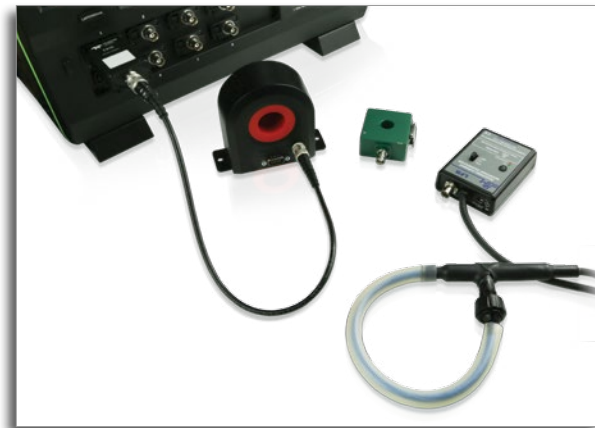
CA10 ProBus current adapter attached to a Danisense Current Transducer. Also shown is a Pearson Current Transformer and a PEM-UK Rogowski Coil, which are also third party devices that can be used with the CA10.