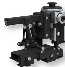
Atlantic-Style SF Mechanical