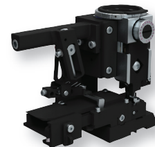
Pacific-Style SF Mechanical