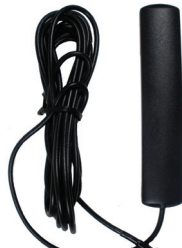
Antenna Type Code "03"

WAN02RSP tilt & swivel design, 2.2 dBi gain, direct mount connector