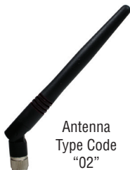
Antenna Type Code "02"

WAN01RSP straight design, 2.2 dBi gain, direct mount connector