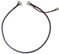
Figure 3: ESCCPC5V

The most common cable choice for the any GTT display, the Extended Communication/ Power Cable offers a simple connection to the unit with familiar interfaces. A DB9 and floppy power header provide all necessary input to communicate to and power your display.