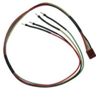
Figure 4: BBC

For a more flexible interface to the GTT, especially with the I 2 C protocol, a Breadboard Cable may be used. This provides a simple four wire connection that is popular among developers for its ease of use in a breadboard environment.