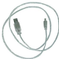
Figure 5: EXTMUSB3FT

The External Mini-B USB Cable is recommended for USB communication. It will connect to the Mini-B style header on the unit and provide a connection to a regular A style USB connector, commonly found on a PC.