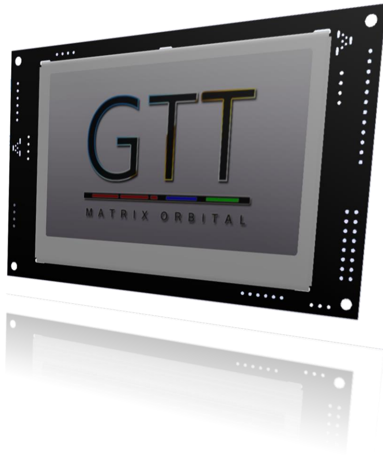
Figure 1: The GTT43A Display