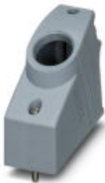
Sleeve housing, plastic, with metric cable outlet, locking screws with cylinder head, type: VC2, cable screw connection: M25

Please be informed that the data shown in this PDF Document is generated from our Online Catalog. Please find the complete data in the user's documentation. Our General Terms of Use for Downloads are valid ( http://phoenixcontact.com/download )