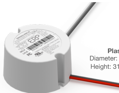
Plastic Case Diameter: 58 mm (2.28 in) Height: 31.7 mm (1.25 in)