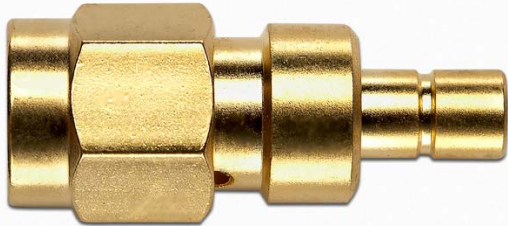
Model 72976 SMA (M) TO SMB (M)