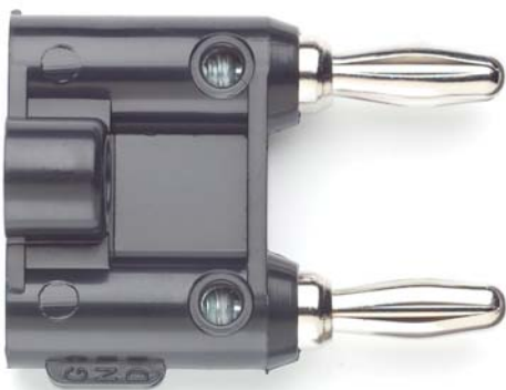
Model MDP, 4892, 4898 Stackable Double Banana Plug with Cable Guide