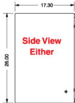
Side View Either