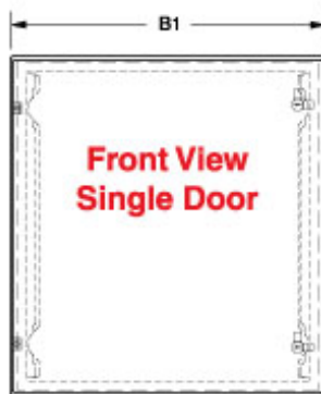
Front View Single Door