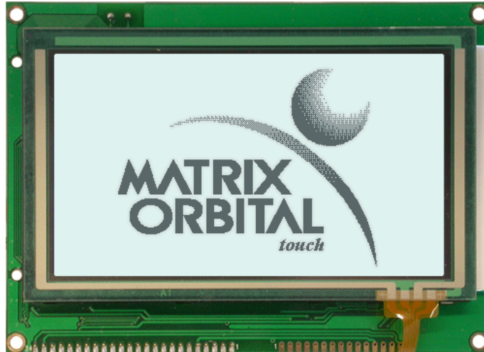
Figure 1: GLK240128-25/GLT240128 Display

The GLK240128-25/GLT240128 is an intelligent graphic liquid crystal display engineered to quickly and easily add an elegant creativity to any application. In addition to the RS232, TTL and I2C protocols available in the standard model, USB and RS422 communication models allow the GLK240128-25/GLT240128 to be connected to a wide variety of host controllers. Communication speeds of up to 115.2kbps for serial protocols and 100kbps for I 2 C ensure lightning fast text and graphic display.