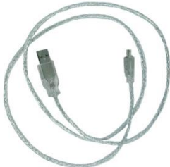
Figure 5: Mini USB Cable (EXTMUSB3FT)

The External Mini USB cable is recommended for the GLK240128-25-USB/GLT240128-USB display. It will connect to the miniB style header on the unit and provide a connection to a regular A style USB connector, commonly found on a PC.