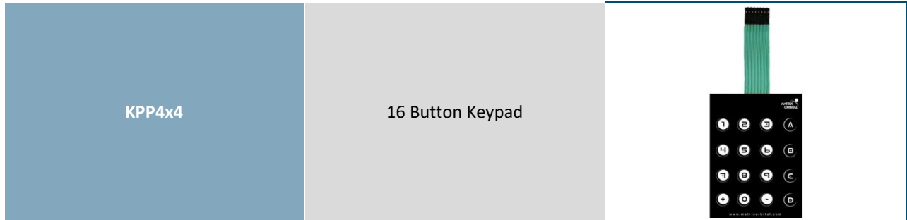
Table 73: Peripheral Accessories