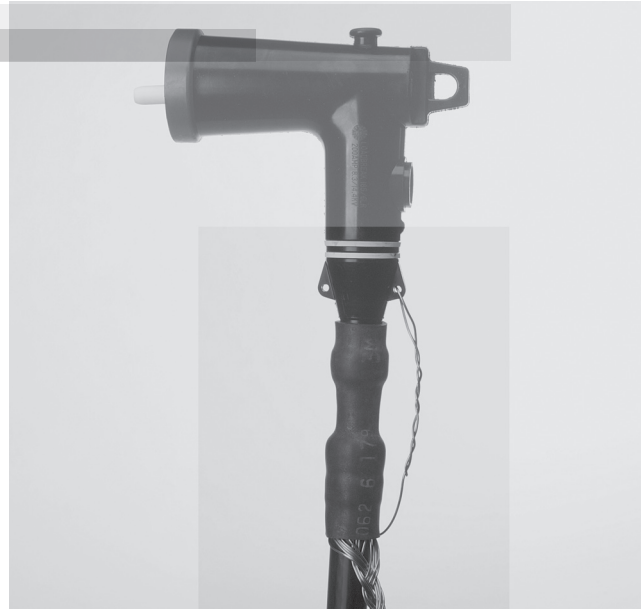
Note: Elbow not included.

The 3M Cold Shrink Cable Accessory Sealing Kits 8450 Series are designed to seal the jacket end of power cables where elbows or other cable accessories are installed. Both the sealing tube and mastic are compatible with commonly used power cable jacketing and semiconductive materials.