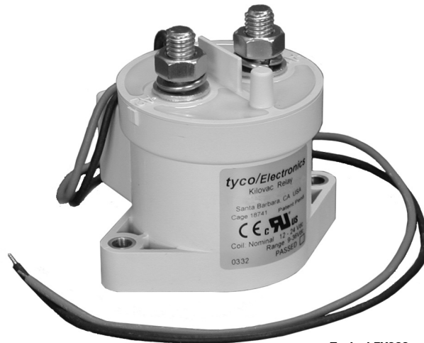
EV200 Series Contactor (CZONKA® Relay, Type III)

Typical EV200 applications include battery switching and back-up, DC voltage power control, circuit protection and safety.