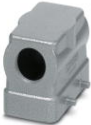
HEAVYCON B10 sleeve housing, for double locking latch, height: 56 mm, with 1 x M20 thread, lateral cable outlet

Please be informed that the data shown in this PDF Document is generated from our Online Catalog. Please find the complete data in the user's documentation. Our General Terms of Use for Downloads are valid ( http://phoenixcontact.com/download )