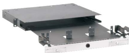
Opticom™ Rack Mount Fiber Enclosures