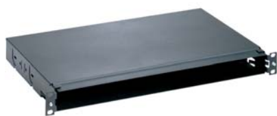
Opticom™ Rack Mount Fiber Trays