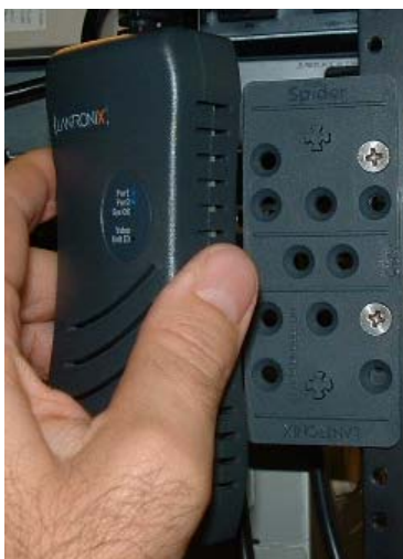
2. Attach the Spider to the bracket's mounting posts