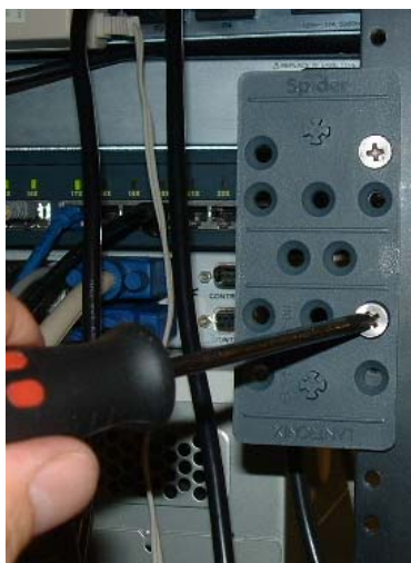
1. Mount the bracket with a Phillips-head screwdriver

There are 3 easy steps to install the mounting bracket and Spider into a server rack: