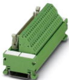
VARIOFACE COMPACT LINE, interface module for 32 channels, with LED, for assembly on DIN rail NS 35/7.5, spring-cage connection

Please be informed that the data shown in this PDF Document is generated from our Online Catalog. Please find the complete data in the user's documentation. Our General Terms of Use for Downloads are valid ( http://phoenixcontact.com/download )