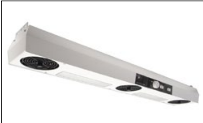
Figure 1. SCS 991A Overhead Air Ionizer