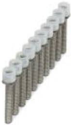
Jumper, Number of positions: 10, Color: silver

Please be informed that the data shown in this PDF Document is generated from our Online Catalog. Please find the complete data in the user's documentation. Our General Terms of Use for Downloads are valid ( http://phoenixcontact.com/download )