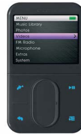
Portable audio player