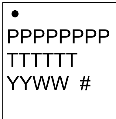
Figure 7.3. Package Marking