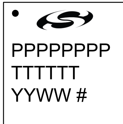
Figure 6.3. QFN28 Package Marking