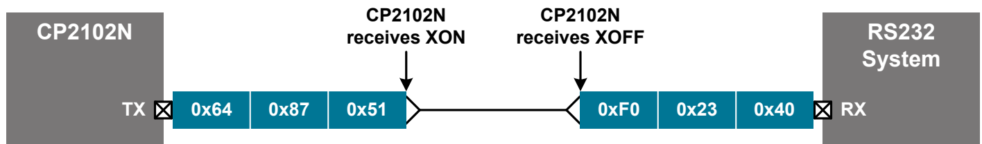
Figure 4.2. Software Flow Control Timing Diagram

Software handshaking uses the same watermark levels as hardware handshaking and can be configured dynamically by host software. Watermark levels greater than 512 are converted to an XON limit of 448 bytes and an XOFF limit of 512 bytes. If the XON limit crosses over the XOFF limit, the XON limit will automatically be modified to not cross over the XOFF limit. An XOFF limit of 0 is converted to 64 to guarantee buffer space is available until the UART end device stops transmission. When setting the XON and XOFF limits, it's recommended to use values where the XON limit added to the XOFF limit is less than 512 bytes, like 192/192 or 128/128. CP2102N testing shows that the XON limit set to 192 and XOFF limit set to 192 provides optimal software flow control behavior.