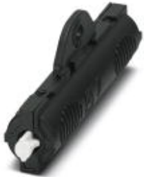
Test pin for SUNCLIX device plug, to check correct positioning of contacts

Please be informed that the data shown in this PDF Document is generated from our Online Catalog. Please find the complete data in the user's documentation. Our General Terms of Use for Downloads are valid ( http://phoenixcontact.com/download )