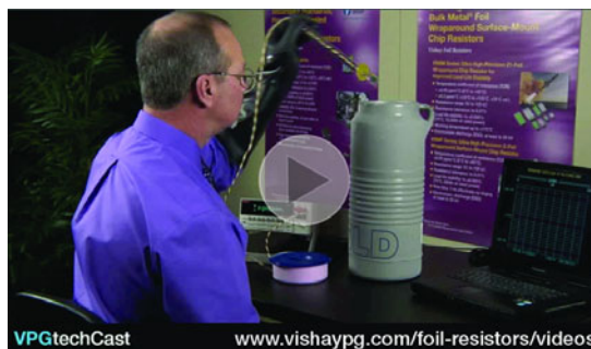
FIGURE 7 - PRECISION RESISTOR IN CRYOGENIC CONDITIONS - ONLY 5 PPM/°C (PRODUCT DEMO)

Different expansion/contraction rates of composite materials in resistors may induce discontinuities during temperature excursions that are not evident at temperature extremes, making an unreliable resistor appear normal. A good resistor must also return to its initial value with no resistance drift. In this demo, a VFR VSMP0805 precision resistor is monitored through the range of +25°C, down to -196°C and back up to +25°C. Results confirm the VSMP0805 exhibits only 5 ppm/°C TCR, experiences no discontinuities, and returns to its exact same starting value, showing absolutely no change in resistance (< 1 ppm measurement accuracy).