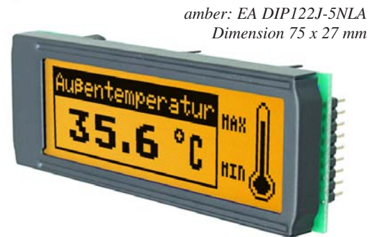
amber: EA DIP122J-5NLA Dimension 75 x 27 mm