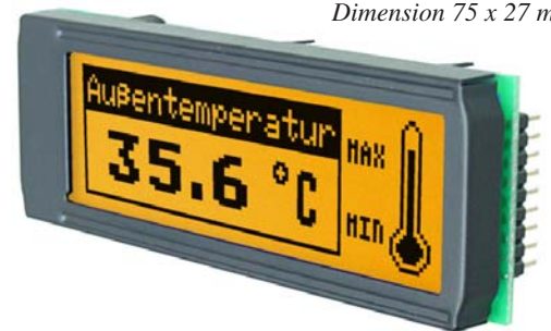
amber: EA DIP122J-5NLA Dimension 75 x 27 mm