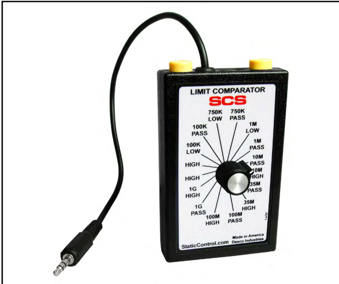
Figure 1. SCS 770751 Limit Comparator