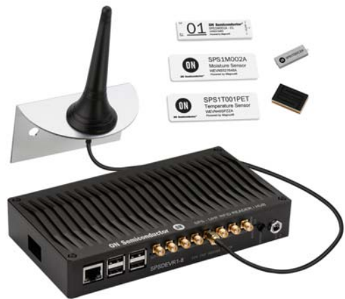
Figure 1. Turnkey Solution Kit Components