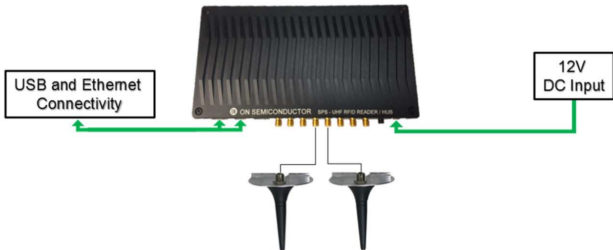
Figure 2. SPSDEVK1MT-GEVK Hardware Setup