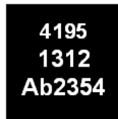
24-L 4x4 mm QFN package

The TGA4195-SM is lead-free and RoHS compliant. Evaluation boards are available upon request.